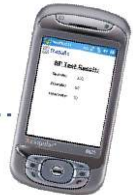
Item #: 903-7006-00C

After performing a test, the results are automatically transmitted via Bluetooth technology to the LifeStar™ handheld device, where it can be viewed and saved. When convenient, the data can be transmitted to the LifeStar™ Network, where physicians may view patient data. Additional remote patient monitoring services are also available. The LifeStar™ Network provides privacy and data protection of patient information, and has the ability to track vital signs data over time.