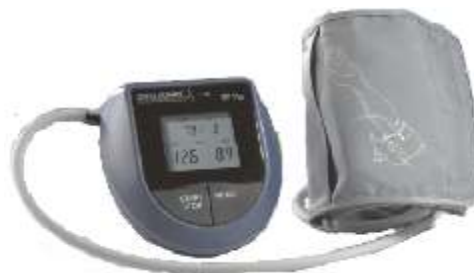
Item #: FG-00017C